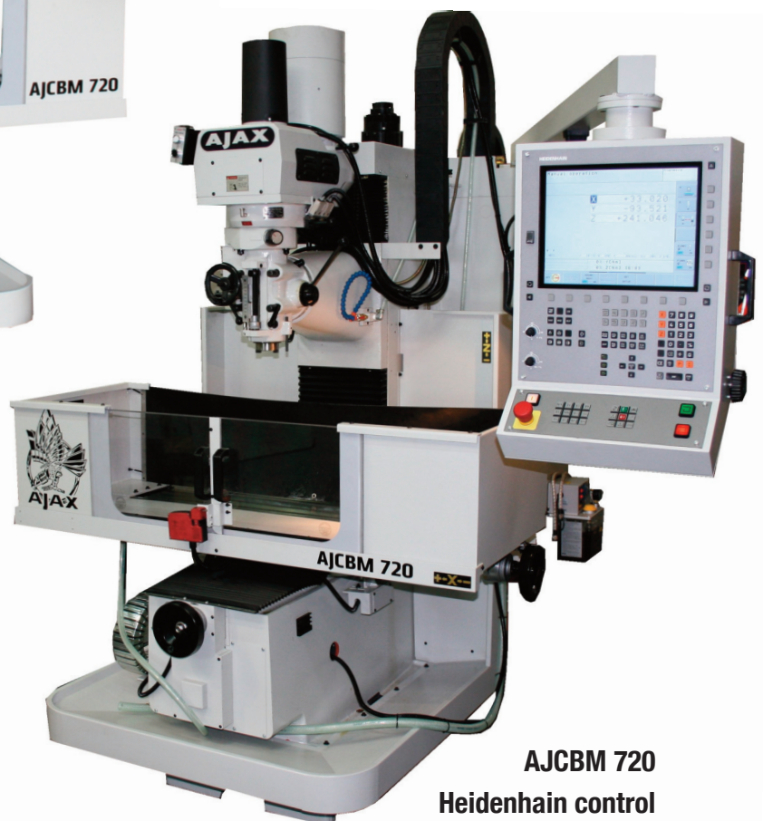
AJCBM 720 Heidenhain control