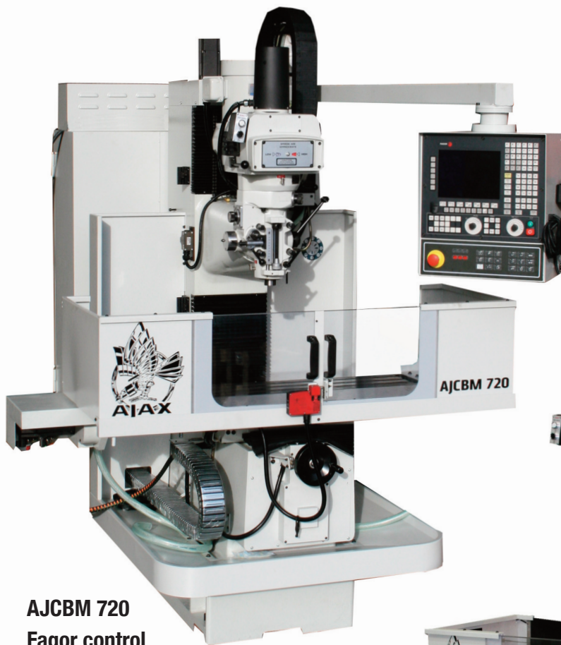
AJCBM 720 Fagor control

The Ajax range of CBM CNC bed milling machine is designed to fill the hole between the machining centre and the tool room mill. With all the advantages of a full CNC machining center it can mill, drill, bore and tap without the confines of the fully enclosed cabinet. The turret style head gives the ability to be able to incline the head to drill and tap holes at an angle it will also mill flats on an angle and drill fine 1mm holes with ease. So any toolroom or jobbing shop needs to have the universality of this type of machine. The main construction is of strong ribbed cast iron with hardened & ground solid box ways with Turcite B giving a smooth running on, all of these features give the classic solid construction.