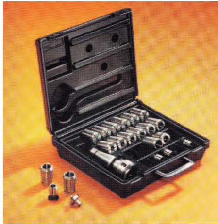
Collet sets available