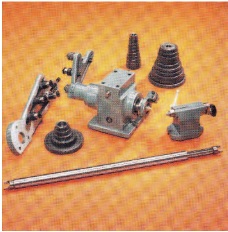
Gear hobbing attachment