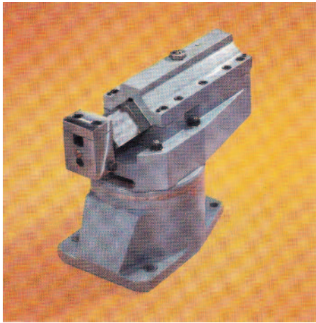
Slotting attachment with adjustable travel to 110mm stroke