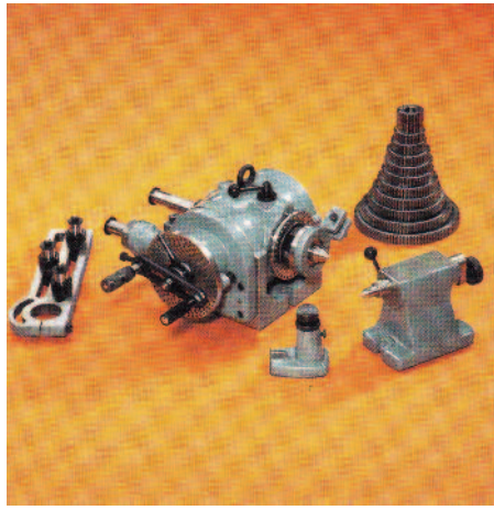
Dividing head, centre height all models 125mm